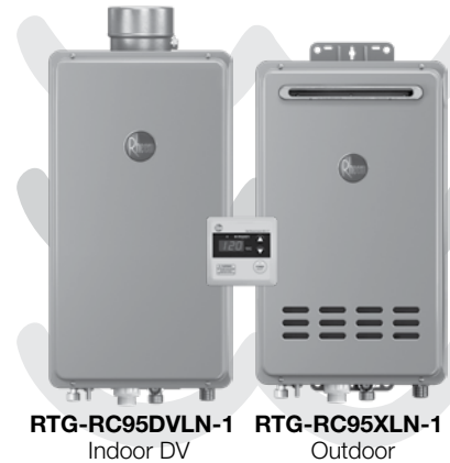
RTG-RC95DVLN-1 Indoor DV RTG-RC95XLN-1 Outdoor

See Warranty Certificate for complete information